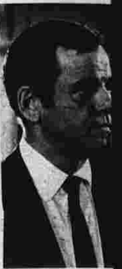
Gig Young in "Companions in Crime," Monday p.m. on NBC.