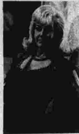
Marilyn Maxwell as a burlesque queen on NBC's "The Outsider," Wednesday 10-11