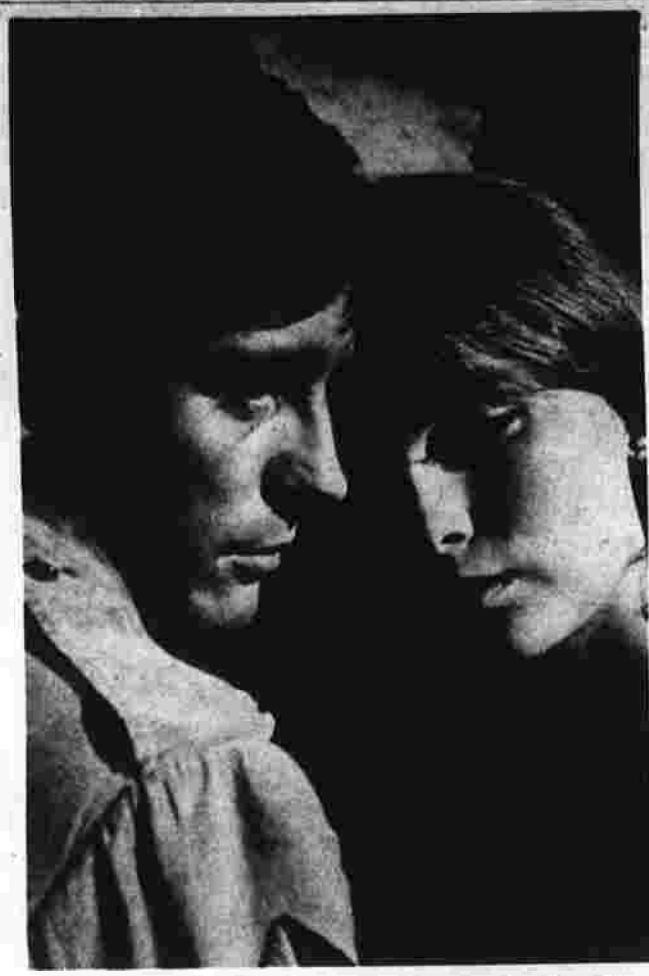
Mia Farrow is in love with John Leyton in film, "Guns of Batasi," Friday 9 to 11 p.m. on CBS.