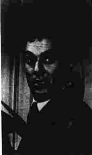
Tony Curtis stars in the film, "Boeing-Boeing," Sunday 9-11 p.m. on ABC.